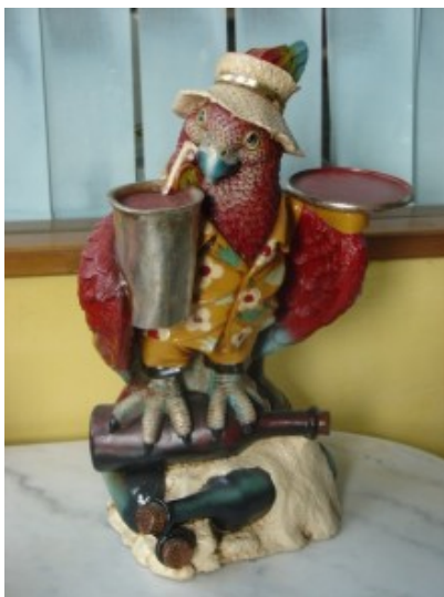
25.M850 H60 CM