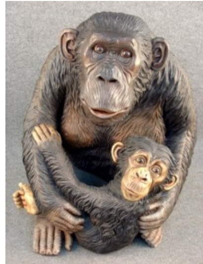
25.N320 H75 CM