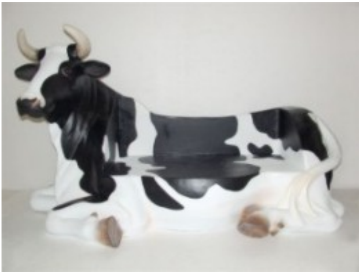
25.P574 H190XL100 CM