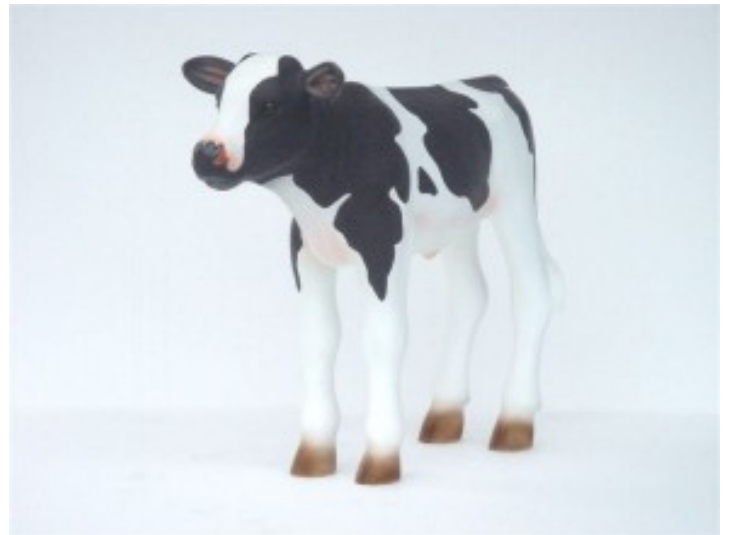
25.M856 85XH65 CM