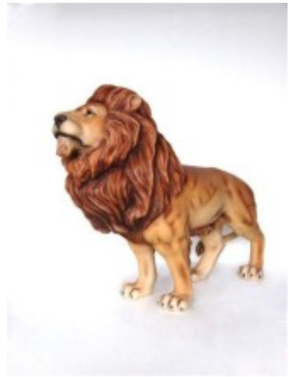
25.R086 172X72XH137 CM