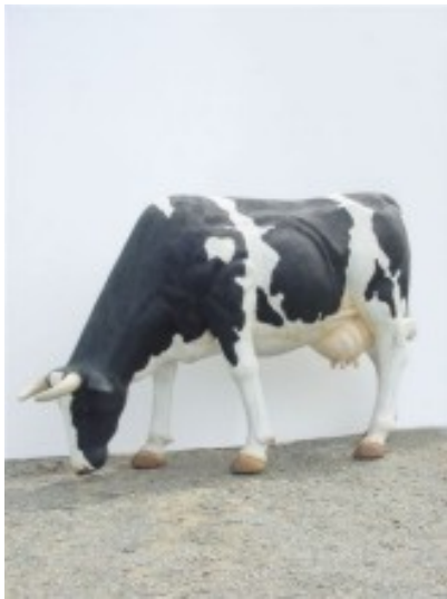
25.H376 190CH130 CM