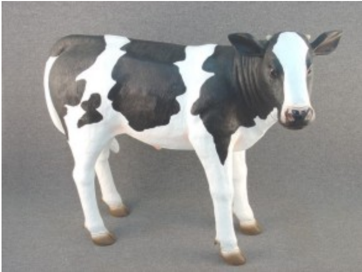
25.H371 100XH118 CM