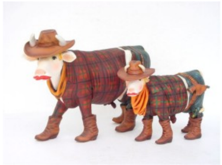
25.R440 25.R439 27X72XH52 CM 20X52XH40 CM