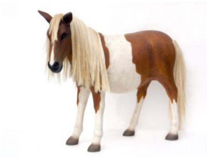
25.T255 159XH125 CM