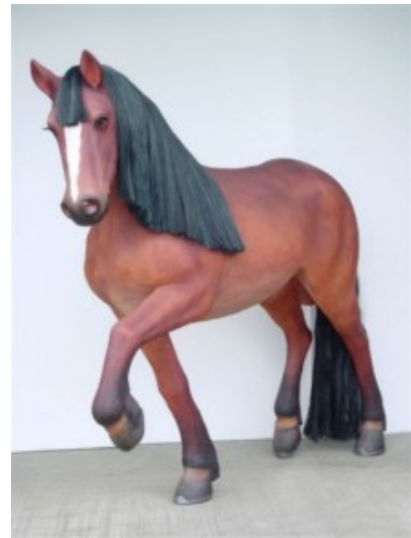
25.R767 228X72X5 185 CM