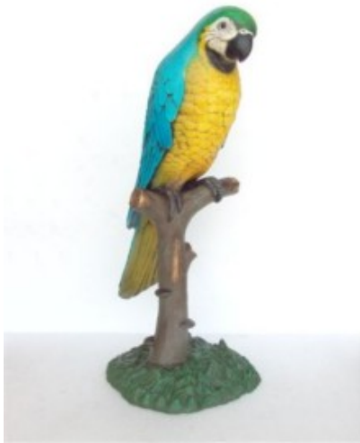
25.T348 H105 CM