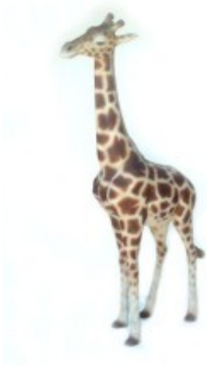
25.R437 190X100 CM