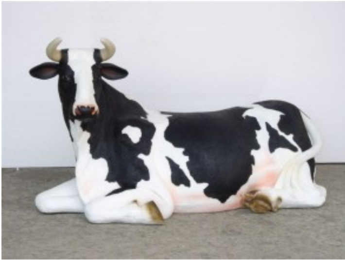
25.R766 H100X190 CM