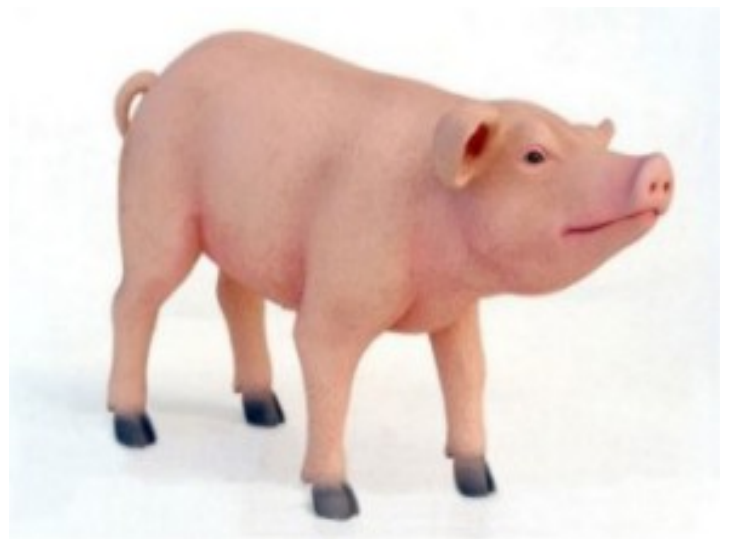
25.T356 80XH47 CM