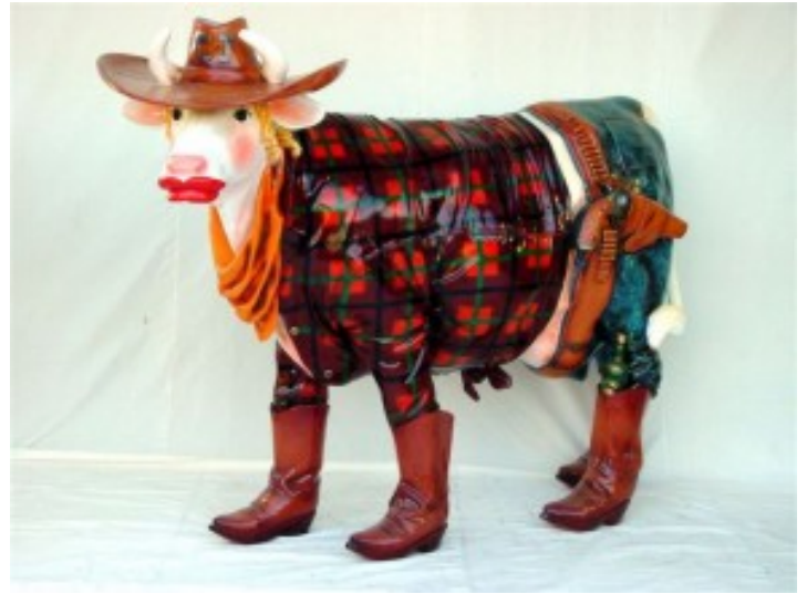
25.R496 H140X190 CM