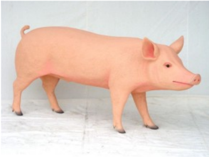
25.H377 165XH80 CM