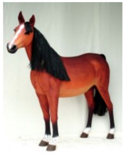
25.H383 L242X67XH217 CM