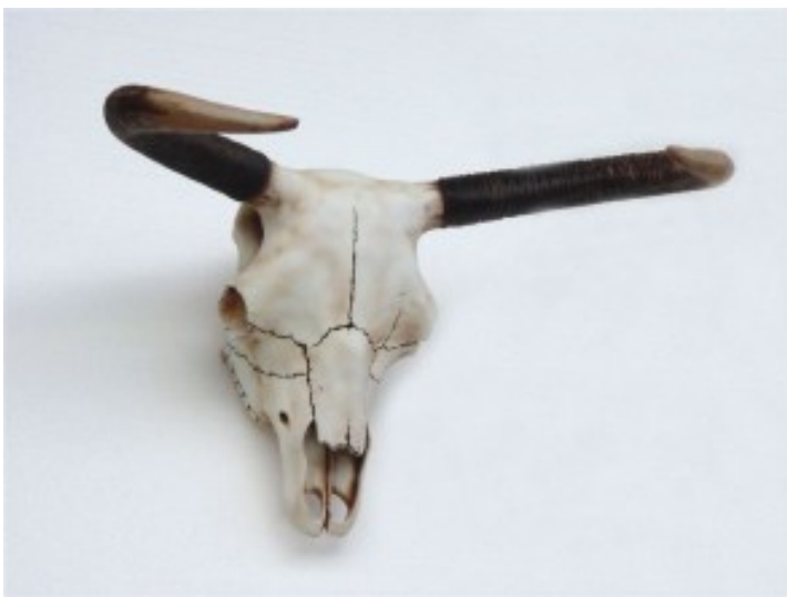
25.M681 80X52XH60 CM