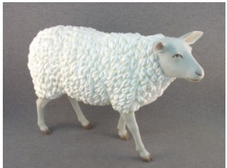
25.M858 130XH90 CM