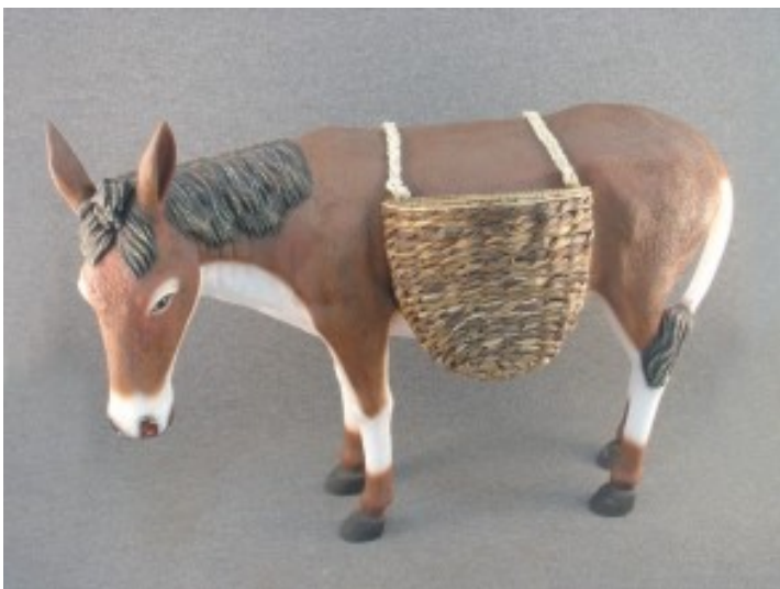
25.M440 147XH103 CM