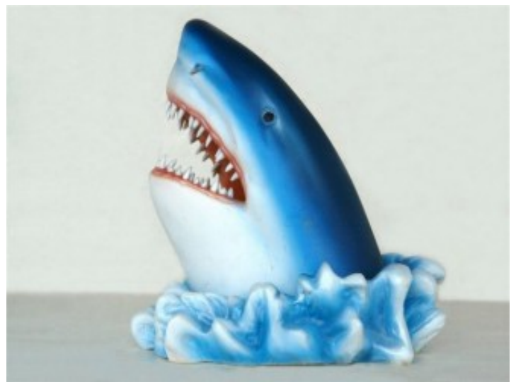
25.T259 H 30CM