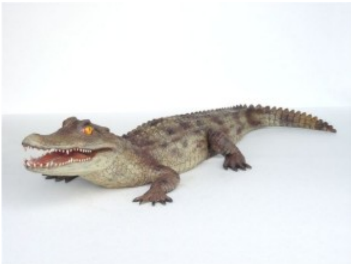
25.P577 210X75XH40 CM