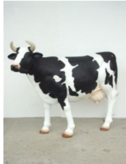
25.H373 190XH145 CM